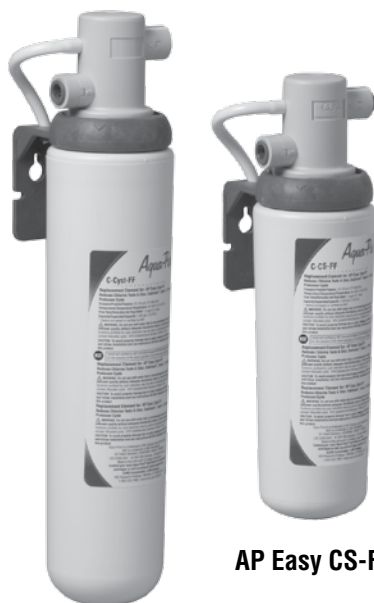
AP Easy CS-FF